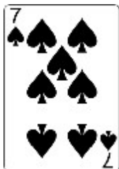
Jimmy 's Planetary Ruling Card